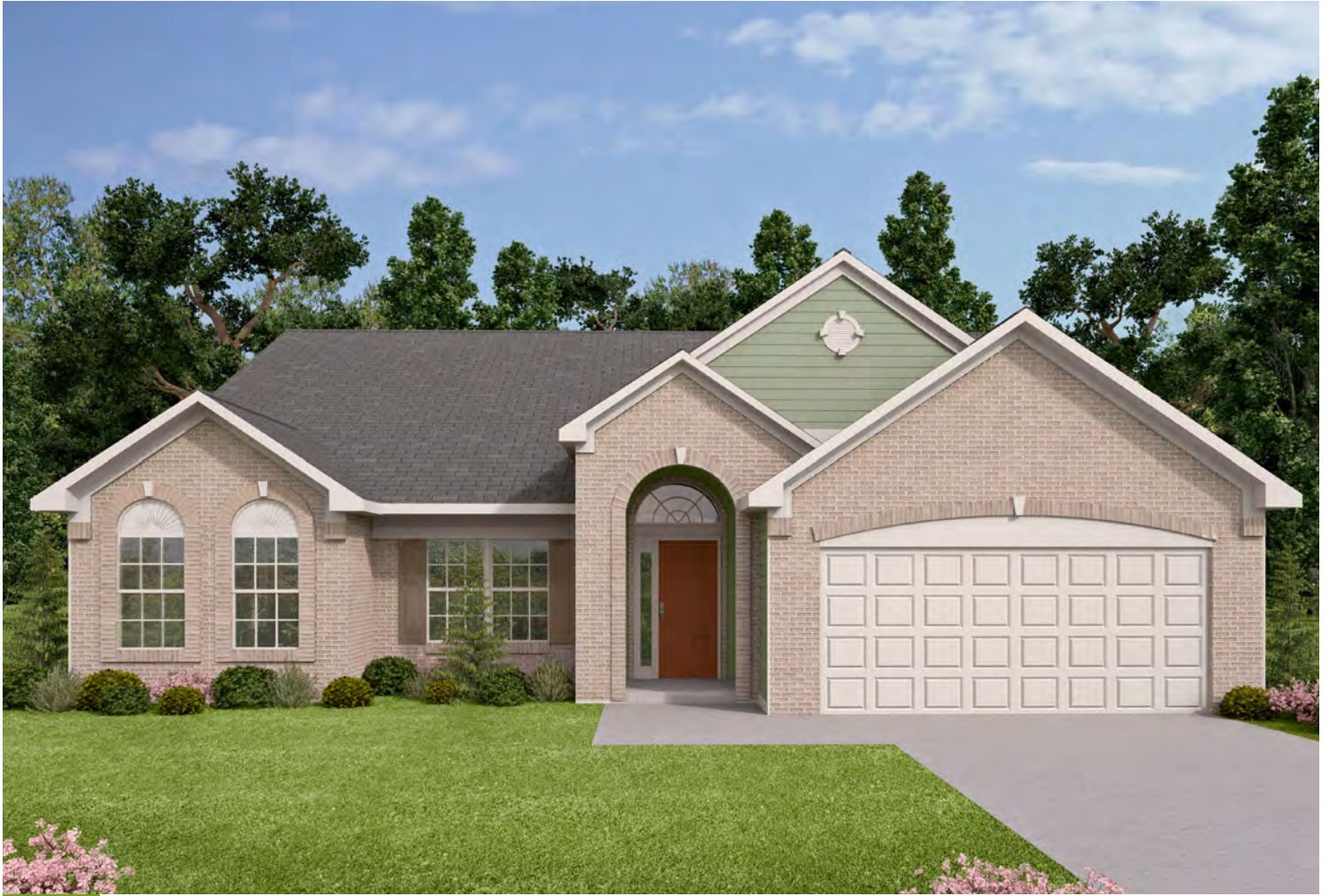
ARTIST'S INTERPRETATION | Additional front elevation options available at davishomes.com