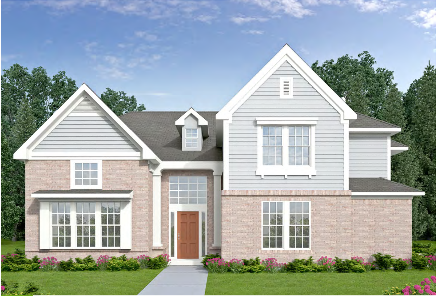
ARTIST'S INTERPRETATION | Additional front elevation options available at davishomes.com