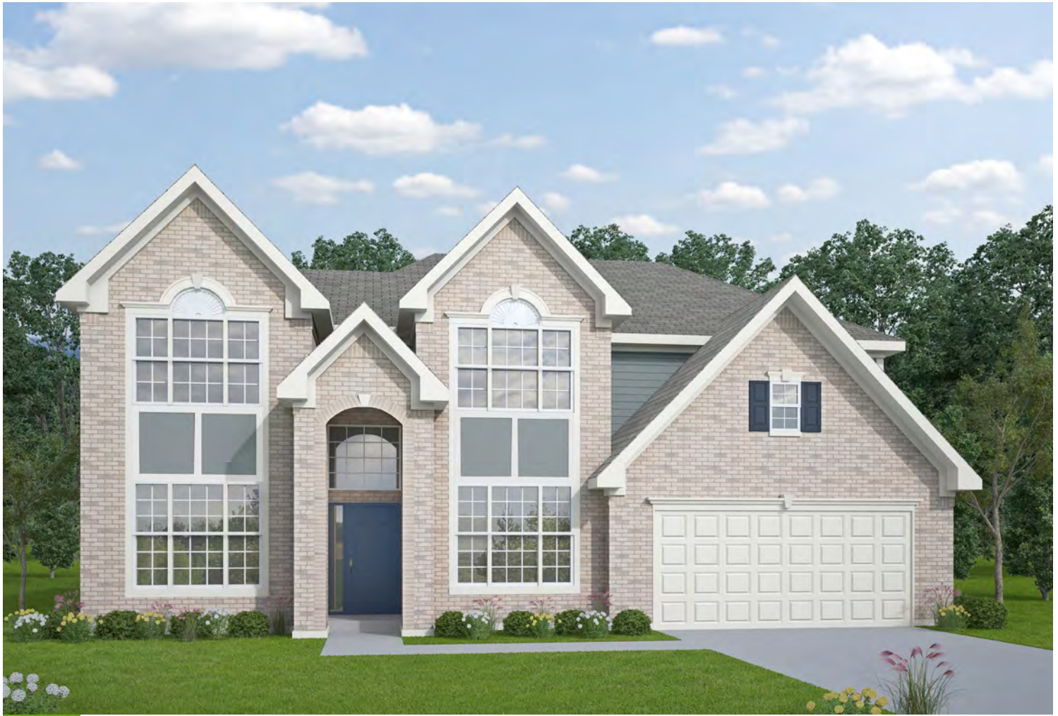
ARTIST'S INTERPRETATION | Additional front elevation options available at davishomes.com